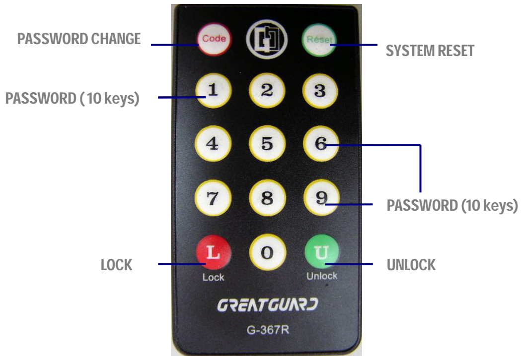
IR remote controller